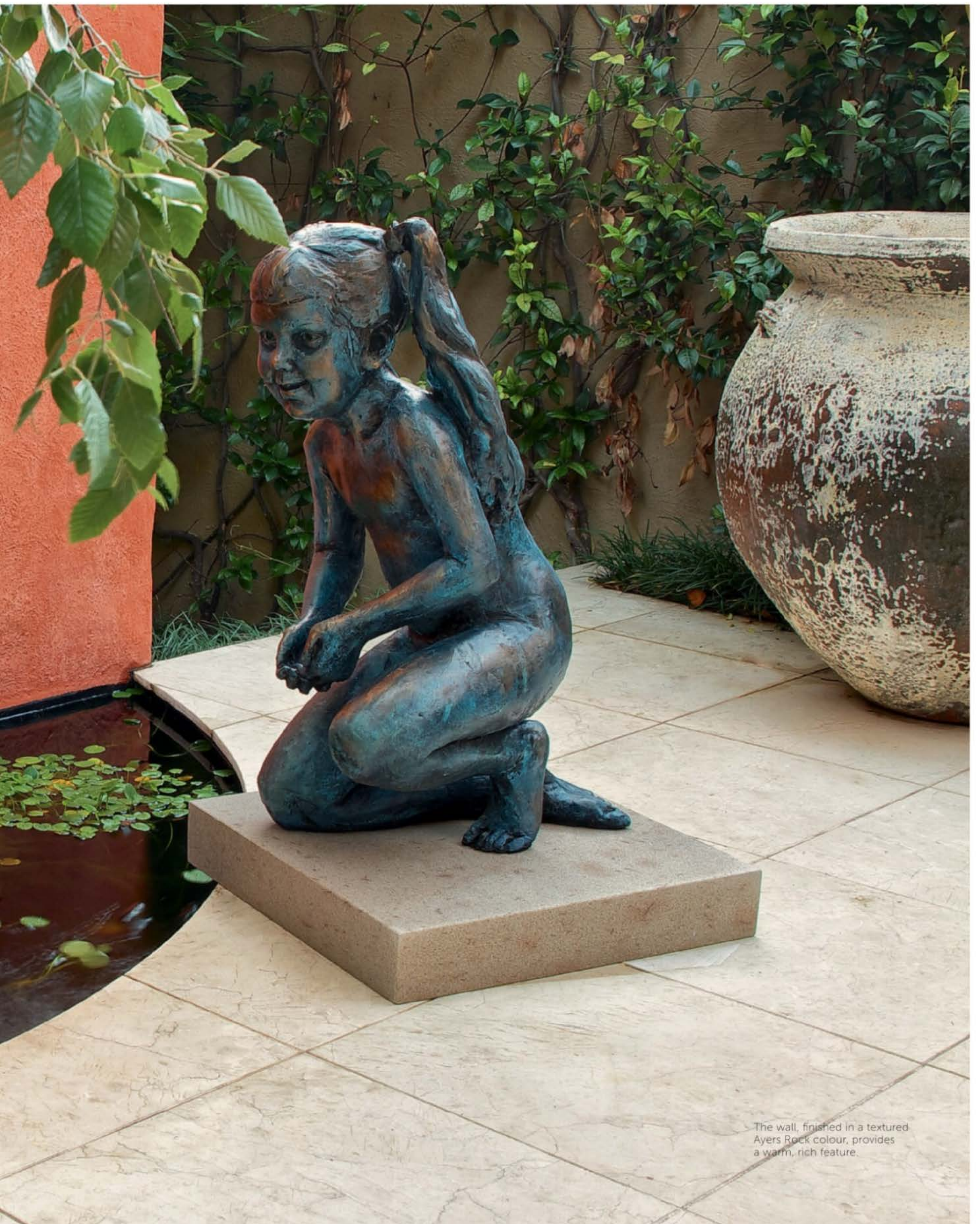
The wall, finished in a textured Ayers Rock colour, provides a warm, rich feature.